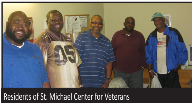
Residents of St. Michael Center for Veterans

Residents of St. Michael Center for Veterans and New Life Center Veterans Housing attended the VA Stand Down in Alexandria, LA. Stand Downs are hosted by the Department of Veteran's Affairs in an effort to provide outreach, services and support to homeless veterans.