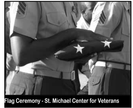
Flag Ceremony - St. Michael Center for Veterans

St. Michael Veterans were remembered and honored by Our Lady of Fatima church this year. A Dinner and a Movie evening was provided for the residents in appreciation of Veterans Day. Dinner was delivered to the veterans and they each received a movie ticket to enjoy a night out as a thank you for serving our country.