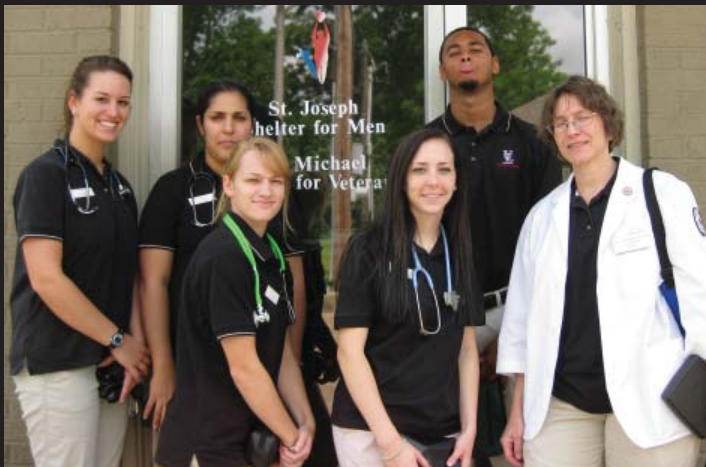
St. Joseph Shelter for Men