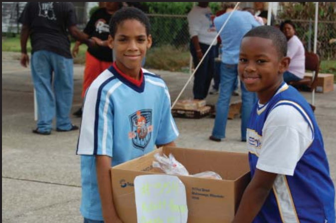
New Life Center