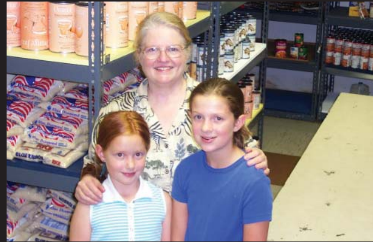
St. Joseph's Diner